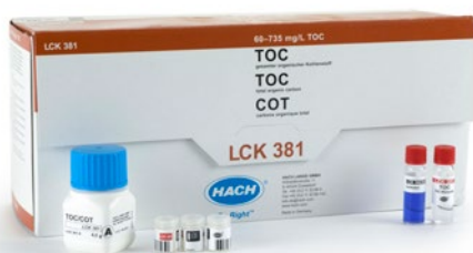
Cuvette test for TOC determination by the difference method