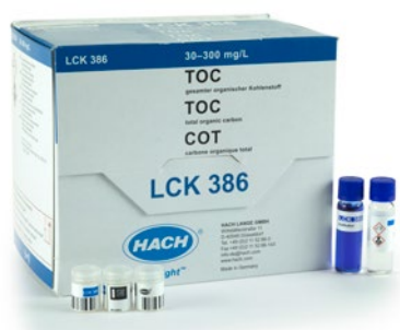
Cuvette test for TOC determination by the purging method