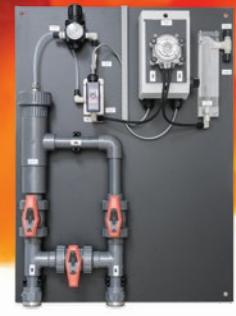
Sample Preconditioning Panel