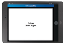
Follow the roadside driving instructions