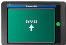
Bypass the site

2) You will then receive one of three driving instructions: