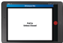
Pull in to the site