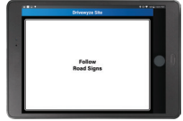
Follow the roadside driving instructions