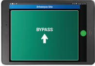
Bypass the site

🔊) You will then receive one of three driving instructions: