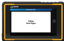
Follow the roadside driving instructions