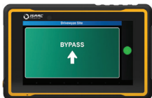
Bypass the site

You will then receive one of three driving instructions: