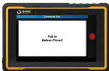
Pull in to the site