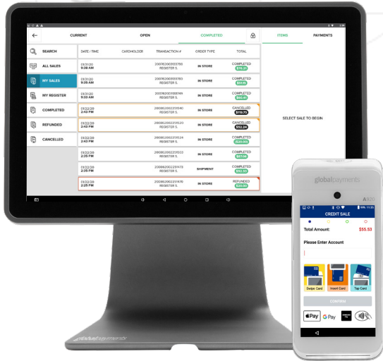
Global Payments Register