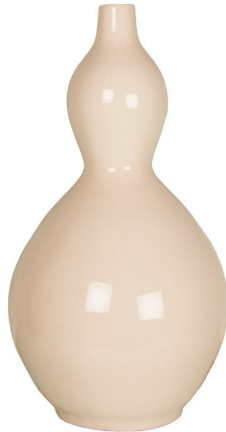
CORA 20"H x 10.25"W (OPTIONAL BASE IS 7"DIA x 1"H)