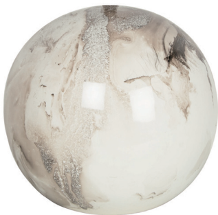
MORGAN 13"H x 12"W (OPTIONAL BASE IS 6"DIA x 1"H)