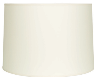
PARCHMENT DRUM (SIZES VARY BY LAMP BODY STYLE)

Either of these classic cream parchment shapes are perfectly scaled for each lamp. No shade needed? No problem. All lamps are available without shades.