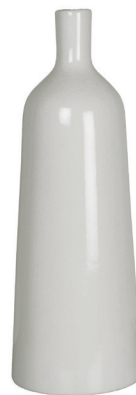
HAVEN 16"H x 6"W (OPTIONAL BASE IS 6"DIA x 1"H)