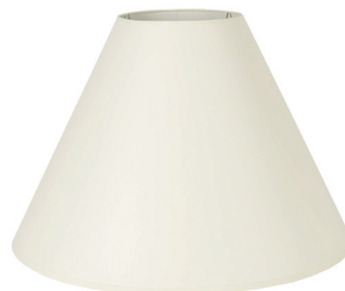
PARCHMENT CONE (SIZES VARY BY LAMP BODY STYLE)