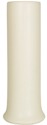
BAKER 18"H x 6.5"W (OPTIONAL BASE IS 7"DIA x 1"H)