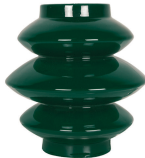
CHESTER 12.5"H x 11"W (OPTIONAL BASE IS 6"DIA x 1"H)