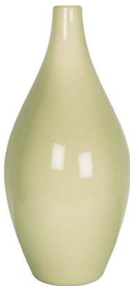
EVERLY 17"H x 8"W (OPTIONAL BASE IS 5"DIA x 1"H)