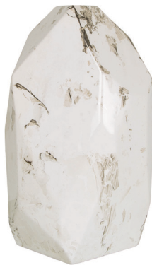
NASH 15"H x 10"W (OPTIONAL BASE IS 7"DIA x 1"H)