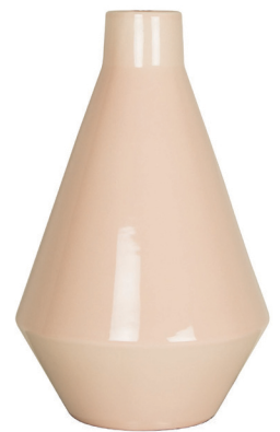
CLOVER 15"H x 9.25"W (OPTIONAL BASE IS 6"DIA x 1"H)