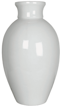
JUDE 20"H x 10.5"W (OPTIONAL BASE IS 8"DIA x 1"H)