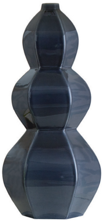
HALLIE 21.5"H x 9.5"W (OPTIONAL BASE IS 7"DIA x 1"H)

Varying in scale and style, these ceramic silhouettes set the foundation to create the perfect lamp to suit any interior.