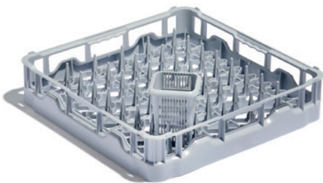
Plate basket and small cutlery holder also supplied, add further baskets to boost kitchen efficiency.