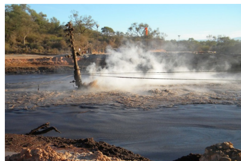
Figure 1. With the well emitting water and carbon dioxide, a crater is formed around it, thus creating a small lake.

In Houston, the Boots & Coots engineering team performed a detailed dynamic kill analysis. The plan called for all necessary equipment – frac pumps, kill lines, mud storage, 6,000 barrels of 12-ppg mud and additives – to be staged and ready for the dynamic kill as soon as hydraulic communication with the target well was established. All rig personnel were briefed and prepared for the operation, using a thorough risk analysis.