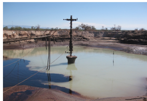
Figure 2. The wellhead is pulled upright after the well is brought under control and dynamically killed via the relief well.