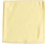
Cleaning Cloth 330x330 mm Yellow, 2/Pack

A flat hard 6 mm thick white felt pad, designed for glass polishing applications. The thick felt pad construction has a good balance and feels stable during polishing. The pad is designed to be used in combination with Polarshine E3 polishing compound and that combination provides a good glass sanding process.