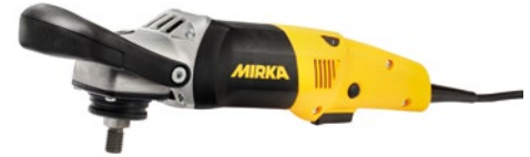
Mirka® PS 1437 Polisher 150 mm

A yellow soft micro fiber cloth, with a fine texture. Absorbs residue well and is washable.