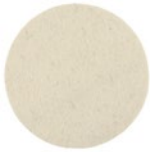
Polishing Felt Pad White, 2/Pack 125x6 mm Grip