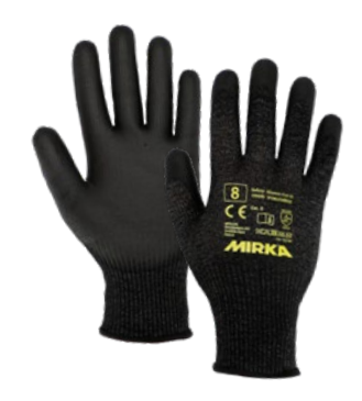
Safety Gloves, Cut-D

Seamless Nylon Assembly Gloves are available for intricate assembly work in different industries, including automotive and plastic assembly.