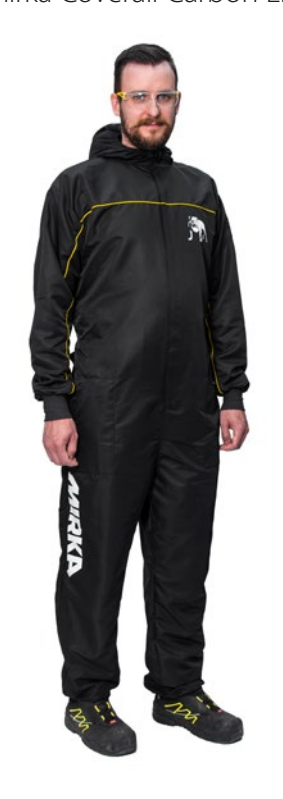
Mirka Coverall Carbon Line