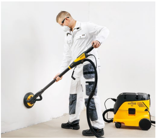
Combine Mirka® LEROS or LEROS-S with Mirka's dust-free net abrasives and suitable dust extraction system to create a cleaner and healthier working environment.

The full length Mirka® LEROS is designed for sanding of walls and ceilings with maximum flexibility.