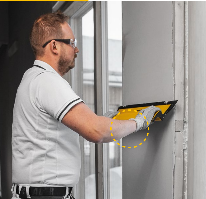
Able to handle the tool without twisting the wrist – less risk for repetitive strain injury