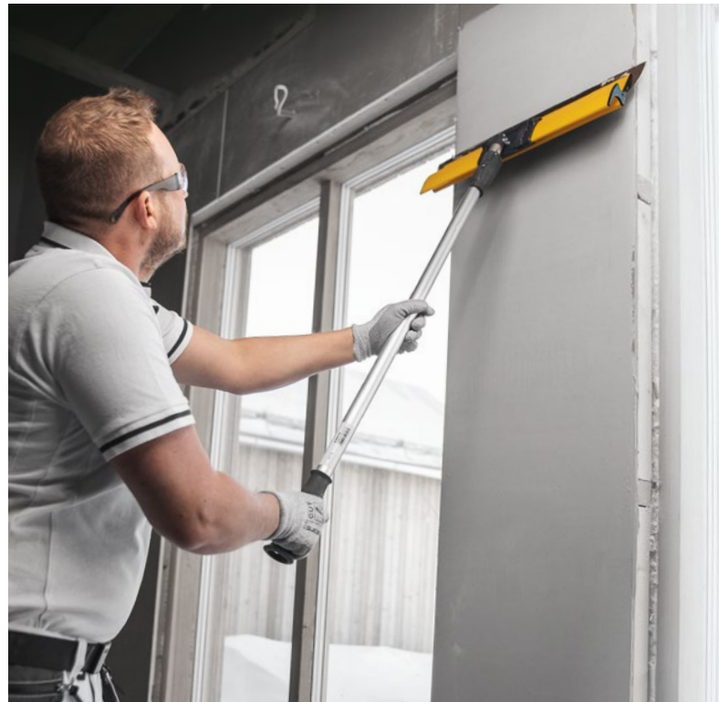
Smoothing plaster with extension pole