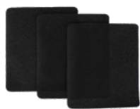
Felt Pad for Edge Guide