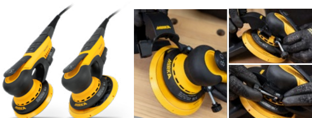
Mirka® DEROS II 550 and 650 (125 and 150 mm)