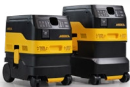
Mirka® DEXOS 1217/1230 M