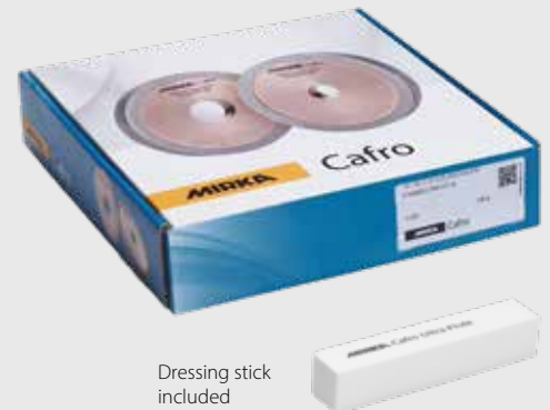
Dressing stick included