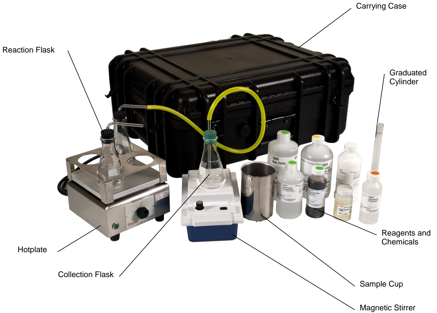
Figure 3-1 PHPA Polymer Concentration Test Kit