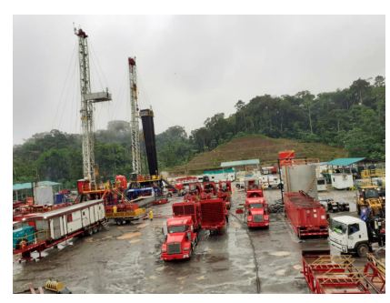
Hydraulic Fracturing and Perforating workover campaign executed onsite with Halliburton's Integrated Services Team

Halliburton recently performed workovers for six wells located in Ecuador's Armadillo field. The objective was to boost the production of these wells by implementing various stimulation methods, such as fracking, injection, perforating, and reperforating. As project management lead, Halliburton designed an integrated solution comprising a rig, slickline, diesel, and vacuums, as well as third parties. In particular, Halliburton applied a local contract to sell tubulars to the client, saving the project approximately USD 100,000. Other savings came from technology choices,