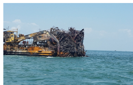
Fire from the blowout causes the derrick to collapse on the barge.

The underwater survey showed that the well platform, casing, and tubing strings had been bent and collapsed on the well (as illustrated below), increasing the challenges. Additional debris littered the lake bed surrounding the wellhead, which restricted access and the ability to clearly monitor the wellhead. Furthermore, the turbulence from the gas flow through the debris disturbed silt and clay on the lake bed and clouded the visibility around the well.