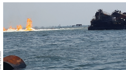
Surfacing gas spontaneously catches fire on the lake surface.