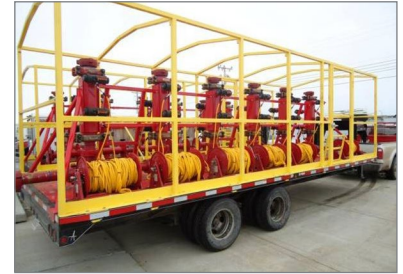
RapidSuite® Pneumatic ball launcher

Halliburton proposed running a 16-stage cemented RapidStage® system on a long string of production casing. RapidStage frac sleeves allow each stage to be fractured by dropping a ball from surface, thus helping to eliminate the need for wireline intervention. The process begins with the Halliburton RapidStart® Initiator sleeve at the toe of the well to provide a flow path once opened with tubing pressure. Efficiency further increases when using the RapidSuite Pneumatic Ball Launcher to remotely release balls in the frac stream during continuous pumping. The entire completion is cemented in place with SoluCem® acid soluble cement to make fracturing the formation easier.