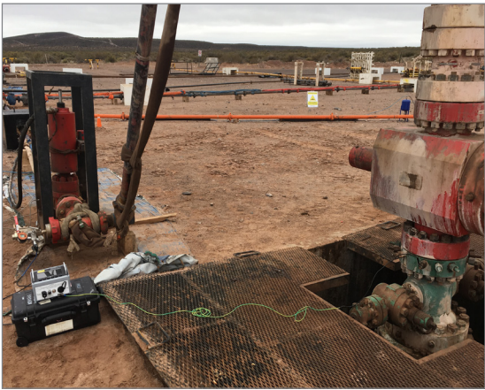
InnerVue™ WellSuite diagnostics equipment setup at the wellsite.

Halliburton Pipeline & Process Services offered its InnerVue™ WellSuite diagnostics service, which is a safe, non-intrusive solution for locating and profiling restrictions along the wellbore flow path. In close communication with the customer, a survey was planned in the 5-1/2” production casing of about 5,900m MD within a long perforation zone in the horizontal section of the well. This innovative method led to high quality results that ultimately enabled better decision-making and successful intervention.